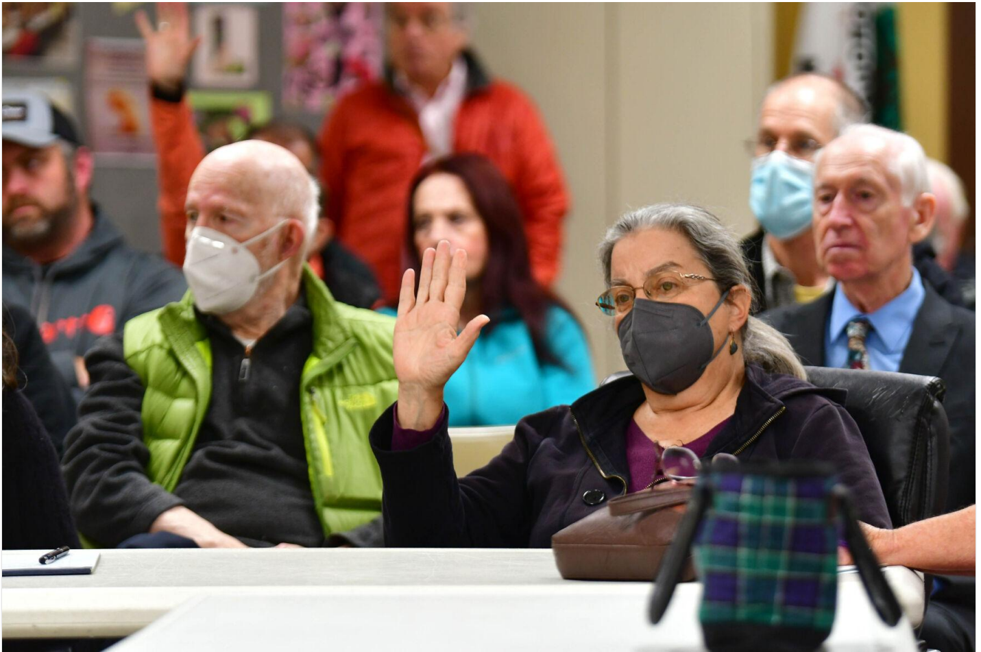
Lanesborough residents seek answers on proposed cannabis mini-farms at the former Berkshire Mall